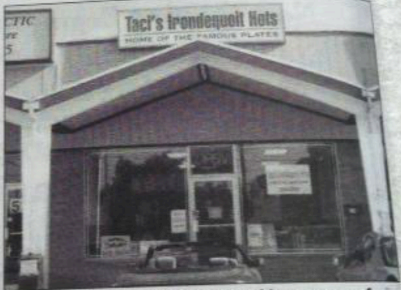
Taci's Irondequoit Hots is named in memory of Taci, Diana and Z. Dimovski's late son.

to 1984. Diana has been in the restaurant business for 25 years, and it shows in the quality of their meals. The food here is all freshly prepared when you order it. It is not reheated or put in a steam table. One specialty is what they call "The Plate". Although many restaurants offer "garbage plates", their